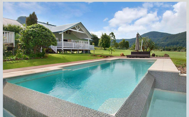
A partial out-of-ground installation of a Vogue swimming pool with cascading edge features