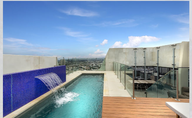
A Fastlane lap pool installed on a high-rise rooftop

The MaxiRib™ system uses a series of carefully placed ribs to provide added strength to the pool walls. This, coupled with the already-enhanced ceramic composite pool shell ensures the pool is strong enough to be installed in the most complicated of sites.